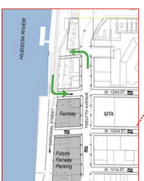
Changes to the Henry Hudson exit and entrances would substantially improve traffic safety.

Development of a potential MetroNorth stop at 125<sup>th</sup> Street would create a new core of pedestrian and commuter traffic. The MTA is currently investigating this option as part of the Penn Station Access Study.