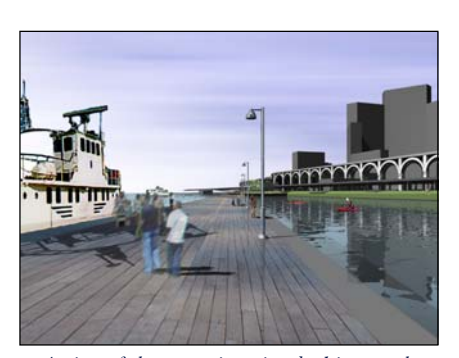
A view of the excursion pier, looking north.

The ultimate test of a project is its longevity. A priority for EDC is to establish a community amenity that serves as a focus of activity. To create this activity and to help generate income that could assist with maintenance costs, it is envisioned that a private developer or institution would create a 10,000 sq. ft. building at the north end of the site. Uses might include a restaurant, retail space, and a visitors or education center.