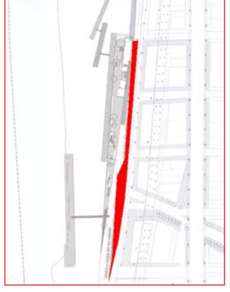
The area shown in red is the space that would be gained for public use by the short-term roadway improvements.