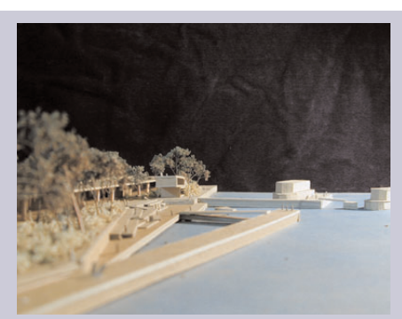
EARLY DESIGN MODEL

We are keeping an aggressive timeframe for implementation of the waterfront improvements; we expect construction bidding to occur in early 2004 and anticipate that construction will be completed in the Summer of 2005.