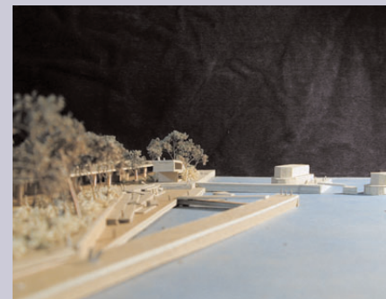
EARLY DESIGN MODEL

EDC welcomes your participation. Please contact the Community Board - (212) 864-6200, or visit our website, www.newyorkbiz/westharlem , for ongoing project updates or call (212) 619-5000.