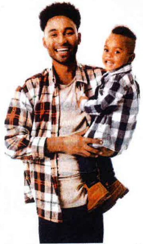
Photo for illustration purposes only. The people shown are models.