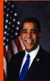
Congressman Adriano Espaillat