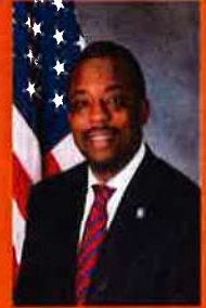
NYS Senator Brian A. Benjamin