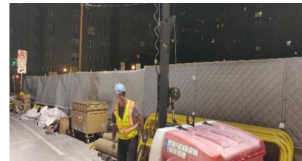
Sound blankets installed to minimize noise.

Please note: There will be no construction activities on New Year's Day.